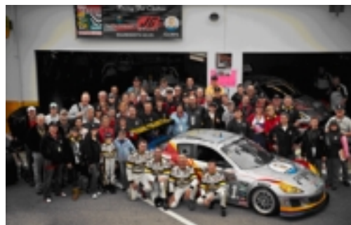
Supporters were on hand to see Team Seattle race at the Rolex 24 Hours at Daytona in January 2010.