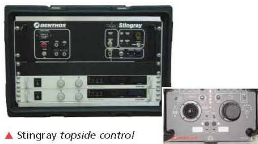
▲ Stingray topside control console and hand control box.

The Handbox connects to the Surface Control Unit with the Handbox extension cable and is used to control all of the Stingray's functions. It is packaged in a rugged, cast aluminum housing with drop protectors and includes a comfortable padded neck strap.