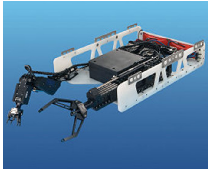
5 Function manipulator and 3 function grabber skid