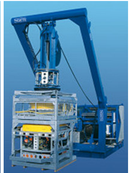
LARS in stowed position with TMS and Cougar ROV ready for transport Cougar TMS & LARS with Snubber Rotator